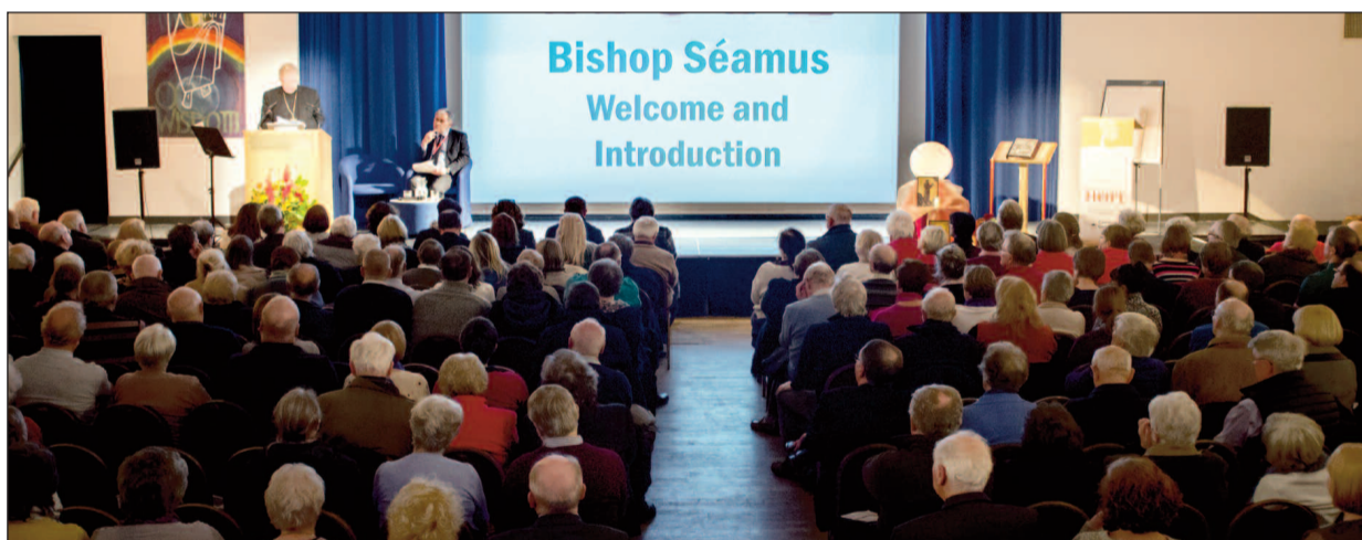
□ Parishoners gathered at Carmel College in Darlington to hear the Bishop outline the Church's plans for the future.