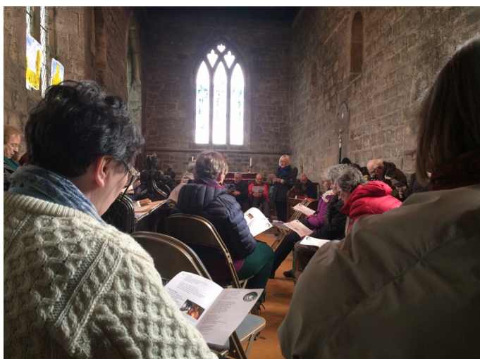
Prayer in St Paul’s

Of course, it is one thing to be told about the land and its saints—and quite another actually to walk it and visit some of the places in person. Jarrow Hall—formerly Bede’s World—opened its doors early for our group who were welcomed with coffee and a soup lunch and a tour around the museum (currently being refurbished but re-opening soon). One real highlight for them was praying in St Paul’s church—in the very place where Bede himself would have prayed. On then to Durham for prayer at Cuthbert’s tomb and to choral evensong. The final pilgrimage involved a 6.30 start for Holy Island where some very hardy souls walked the pilgrim poles to the island!