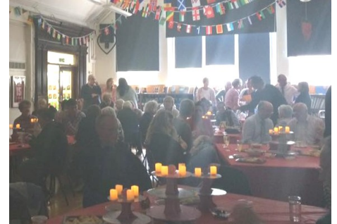
A great welcome from St Cuthbert's Primary School, North Shields

The school laid on a superb welcome which greatly added to the success of the evening—it is the first place we have been to where there was an option of bucks fizz alongside the tea and coffee and nibbles on the tables!