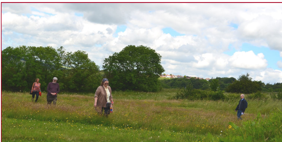
Walking the wildflower labyrinth

With time to prayer, reflection and praise and worship, the Festival offered something for everyone...with many people already booking their places for next year!