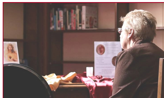
A time of quiet reflection

A course is being developed to take formation for the Ministry of Consolation further. More details will be available in the next issue of Weavings in early September.